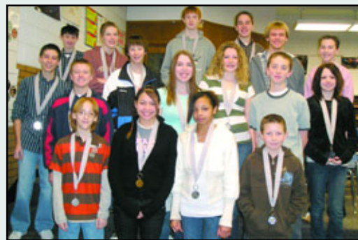
Term 2 Hillcrest Heroes

recognized at a special breakfast in January where they received a medal and a cash award. Congratulations to these outstanding Hillcrest Junior High students: