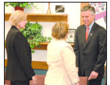
The Governor visited the Murray School District offices in January to share his educational plans and hear from Murray representatives.