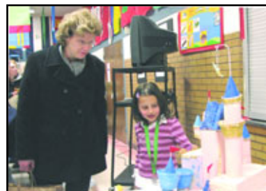
Winning entries on display at awards event.

PTA Reflections Awards Night was held Jan. 25 at Riverview JH with district winners from all grades recognized. Entries were based on the 2006-07 theme, "My Favorite Place...."